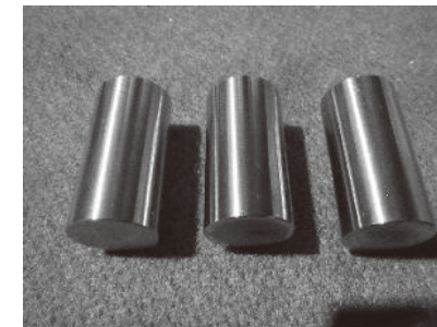
Before the test

Left side:SUS304 / Center:SUS440C / Right side: YSU-1