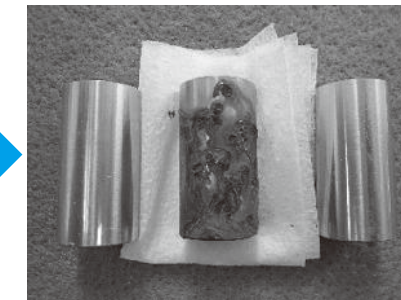
240h After the test